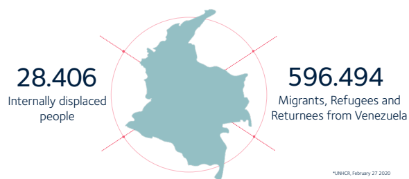
Figure 2: Movement of people to and within Colombia 2019 (Own elaboration with UNHCR data)

While the mass movement of people is not the explanation for Colombia’s instability, it exacerbates the existing security crisis. It is also putting the peace process in jeopardy, with Colombia facing significant challenges of re-establishing new modes of conviviality. These complex interdependencies therefore call for a joined-up policy response that addresses the humanitarian emergency (e.g. providing shelter, food, and improving access to healthcare services), improves security, and tackles deep-seated structural problems such as access to basic services and resources.