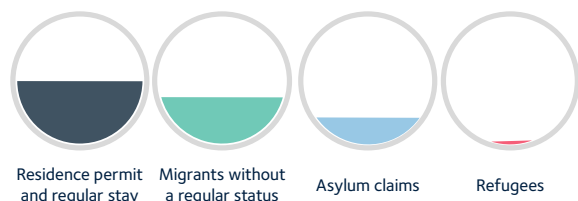
Figure 3: There are approximately 4,730,00 Venezuelan migrants and refugees in Latin America (2020) (Own elaboration with UNHCR data)